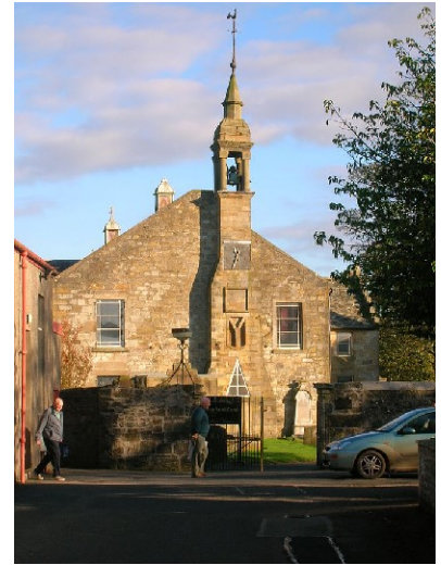
St Columba's Church, Stewarton

Another blessing was the willingness of other Churches to send along members as ‘scouts’ so that they, having had a taste of the series can run one for themselves.