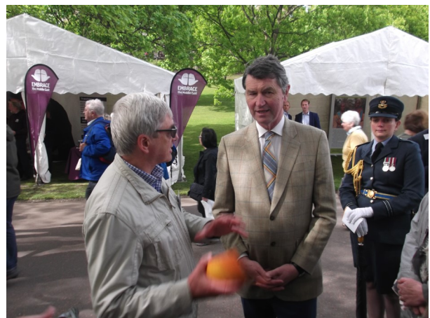
Sir Tim Laurence visits the GTN stand at Heart and Soul