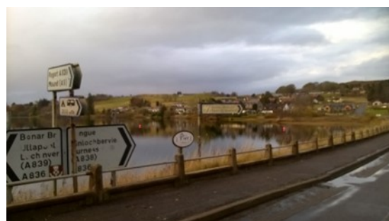
Lairg in Sutherland: the location of the Presbytery Conference which initiated local interest in Exploring the God Question.

Personally I greatly enjoyed each session, appreciating the opportunity to present first class material on a vital subject for our times. It was good to meet with friendly people who were willing to go well outwith their comfort zones to try to reach their communities with the basic message that "God is". While most of those who attended were church goers, and they were disappointed not to draw in those with a strong secular bias, the event equipped us all to engage more confidently with any who struggle with belief in God and boosted the morale of local believers, giving them that sense of achievement which comes from attempting something difficult and succeeding.