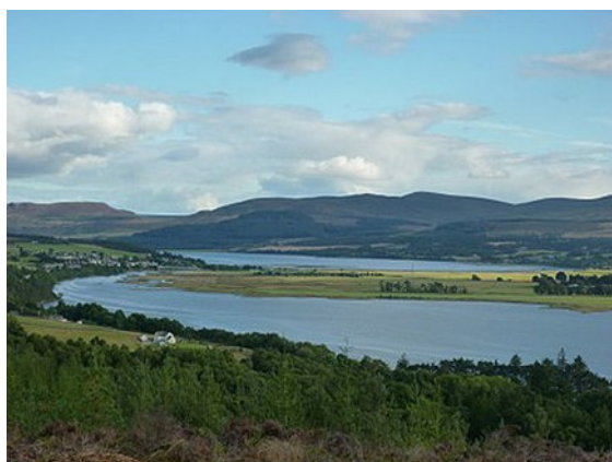
Exploring the God Question amidst the spectacular scenery of the West Highlands.

The Church of Scotland presbytery of Sutherland organised a day conference in Lairg, inviting the series Producer to present the Exploring the God Question programmes with suggestions for how they could be used in the rural setting of the North of Scotland. I was privileged to be present at that conference. Having delivered ETGQ three times in Ross-shire I offered to attend any small groups they might set up.