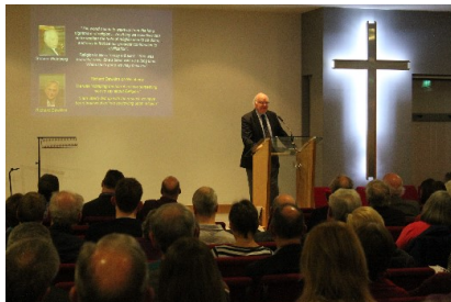
The inspiring GTN Conference 2016

Inspiring speakers confirmed our resolve to try to present the universe through the lens of science and the eyes of faith. The result was a week-long