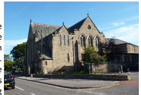
Crown Church, Inverness

Eleven people signed up to be kept in touch with future plans. Directors of some research projects are considering working with us to showcase their work in a future event.