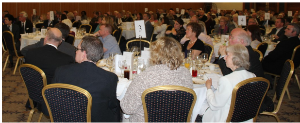
The first GTN Dinner held in the (then) Thistle Hotel, Glasgow

The GTN flag was raised for the first time in June 2014 at a gala dinner. It was followed by the landmark In Concert with the Cosmos the next evening in the Clyde Auditorium, Glasgow. Since then, enormous progress has been made but future plans are in place to take GTN to a more effective and visible place than hitherto. Although we look back with gratitude, this edition of