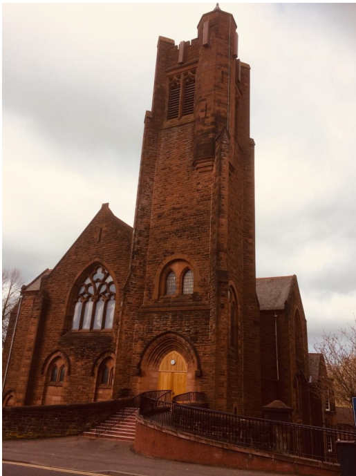
Kay Park Parish Church