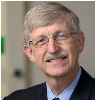
Dr Francis Collins

The organisation—which is one of the most influential communicators of faith and science ideas in the world—originated with Dr Francis Collins who famously, during the Bill Clinton Presidency, led a team of scientists in the ground-breaking process of reading the human genome for the very first time. In lay terms the genome is the 'instruction book for life'. It is responsible for taking every human embryo to a fully formed person. The 'text' has around 3 billion letters. The title of Francis Collins' best selling book, detailing his own perspective on science and God, is "The Language of God". Dr Collins is a key interviewee in Programme Two of The God Question series.