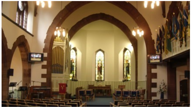
Kay Park Parish Church