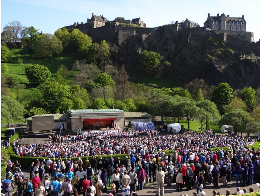
Heart and Soul in Princess Street Gardens.