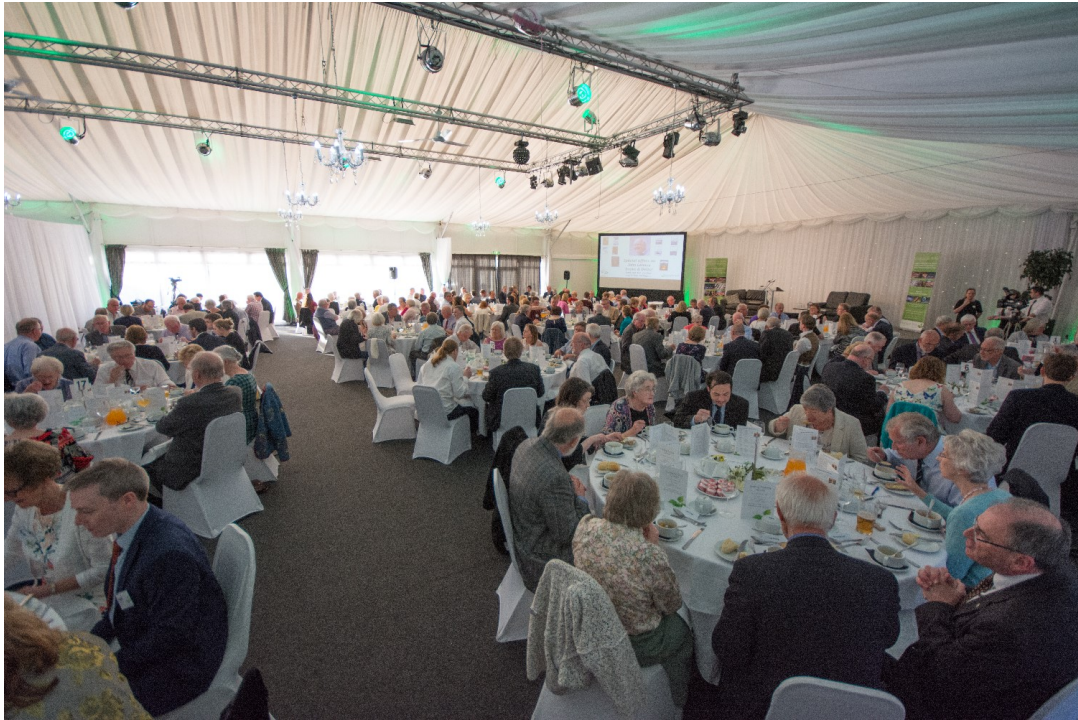
Banqueting Room, Alona Hotel. Also the venue of the 2018 GTN annual dinner

Alona Hotel, Strathclyde Park, Motherwell