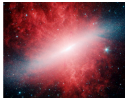
Searching for galaxy clusters in the universe using the Hubble telescope