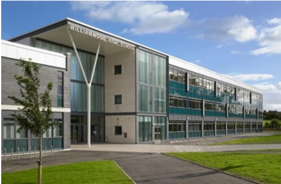
Williamwood High School, Glasgow