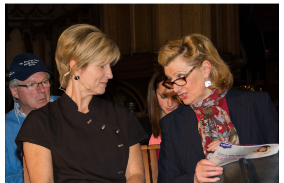
"On Track" One of two short dramas presented as part of the Wonder-Full World event.

The greatly reduced price of tickets for this event is made possible by a grant from the John Templeton Foundation.