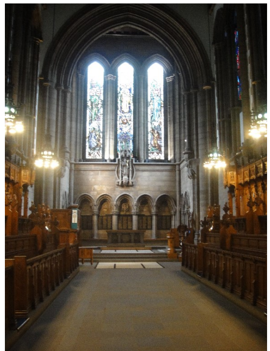
University of Glasgow Memorial Chapel.

The event is made possible through financial contributions from the Presbytery of Glasgow, GTN and a grant from the John Templeton Foundation.