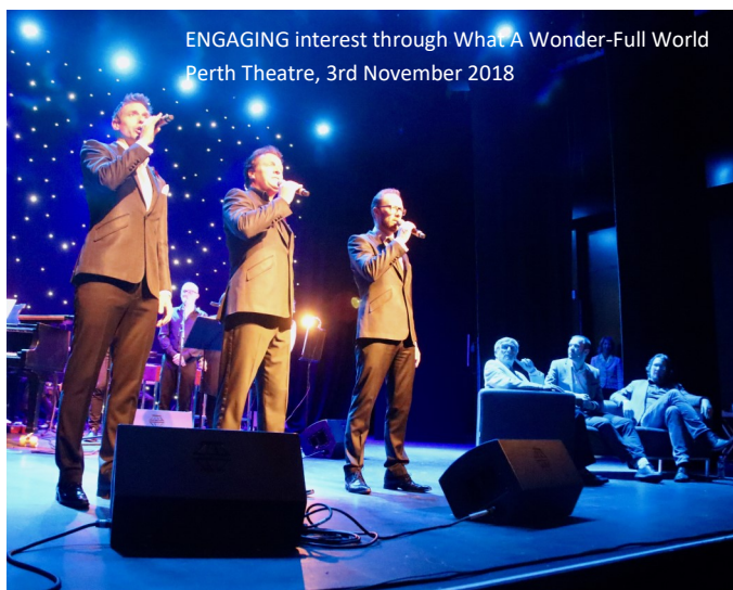
ENGAGING interest through What A Wonder-Full World Perth Theatre, 3rd November 2018

In a society awash with the false choice “Science OR God”, this is self-evidently an important nettle for the church to grasp. But how does it work? In a recent explanation of GTN devised for the John Templeton Foundation in the USA our Scottish interdenominational initiative was summed up in three words: ENGAGING, EDUCATING, ENERGISING.