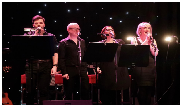
The Wonder-Full World House Band in full flow