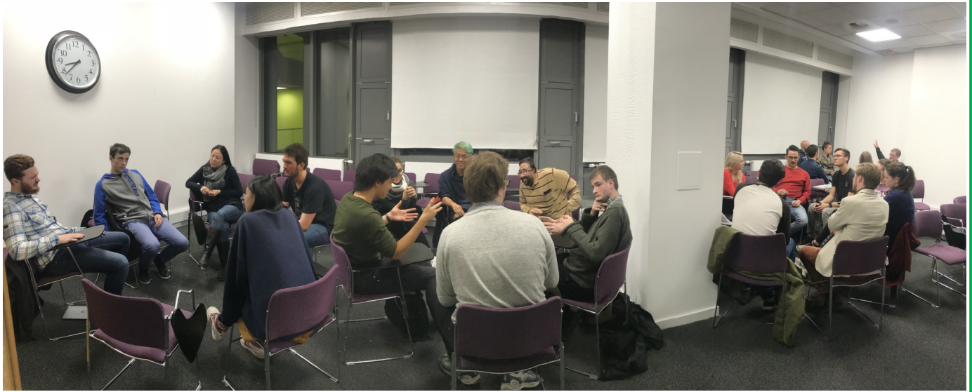
A mixed audience of students in discussion of The God Question at Edinburgh University.