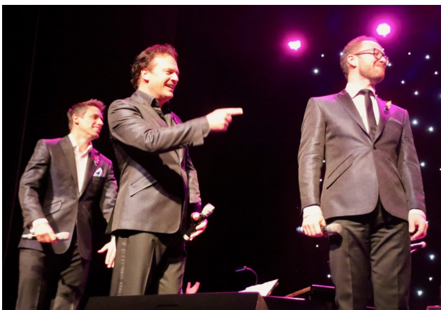
Tenors Un Limited contributing not just through their world renowned music but with sparkling personality.