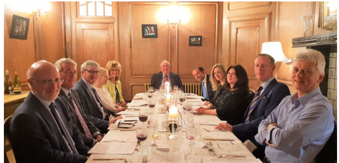
Dinner guests, in the Moderator's apartment, meeting to discuss GTN media and communication.