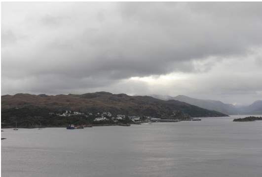
There is much to appreciate in the glories of Scottish landscape

And in a first for GTN, the Moderator has proposed hosting a nature walk in the company of an expert geologist with the purpose of appreciating wonders of the natural world – but not forgetting the importance of the fellowship dimension too. The proposed date is Saturday 23 rd March. Venue: TBA. If you are interested to be kept in touch with plans for this excursion as they emerge, we would be grateful if you would note that interest to office@graspingthenettle.org