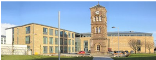
The Nicolson Institute Secondary School in Stornoway where a presentation was given on the curricular relevance of the Introducing the God Question series for schools. Teachers were very enthusiastic about what this resource can contribute to the educational experience of young people in the classroom .