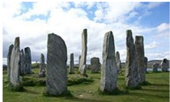
The famous five thousand year old Callanish Stones on the Island of Lewis are a reminder of primitive religious expression in pre-Christian Scotland. Fears have been expressed that Scotland is now in a post-Christian era. A nettle to be grasped.