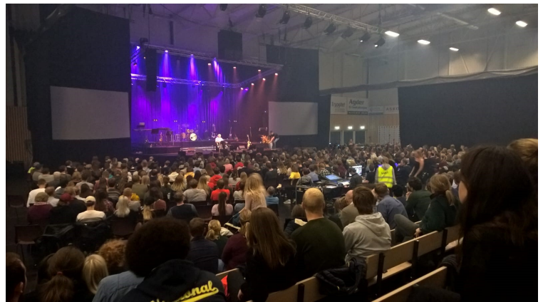
The Veritas Conference attendees being introduced to Finnes Gud?