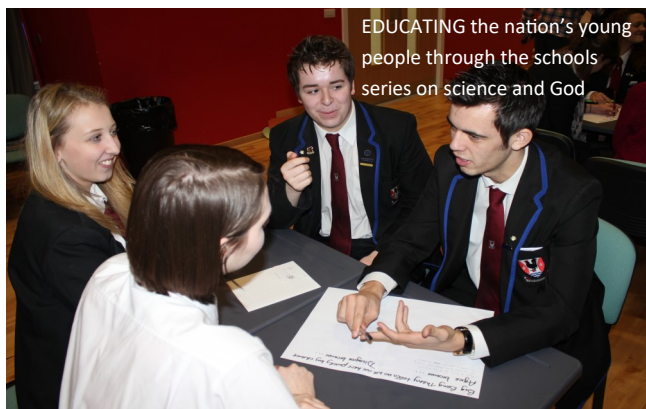
EDUCATING the nation's young people through the schools series on science and God

The most high profile ENGAGING strategy features the GTN branded What A Wonder-Full World! with its blend of music, film, drama and conversation with scientists. The EDUCATING dimension of GTN includes conferences, dinners and online dialogue, developed with a church audience in mind. Exploring the God