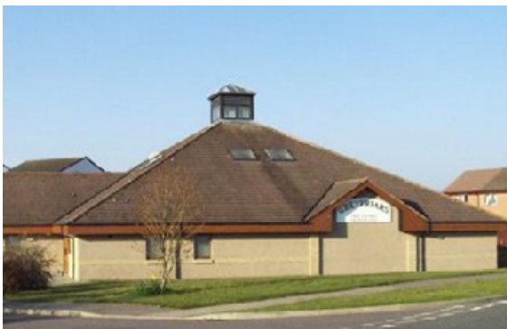
Greysfriars Free Church of Scotland, Inverness, the location of a GTN presentation on the need for churches everywhere to engage with the science/God debate.