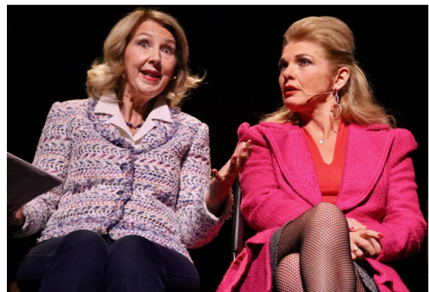
Drama vignette "On Track" in which a hairstylist has a fascinating conversation with a neuroscientist in a railway carriage during the evening commute.

The programme was structured around six key themes: the wonder of the universe, the wonder of life on earth, the wonder of the human body, the wonder of mind and brain, the wonder of emotion and, finally, the big question—'is there anybody there?'