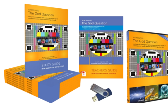
The Introducing the God Question resources.