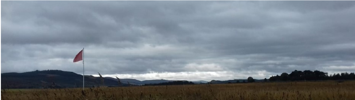
Culloden Battlefield near Inverness, famous for its bloody clash of ideologies in the mid eighteenth century. Scotland still experiences a major clash of ideologies represented by theism and atheism. In the battle science is a crucial witness.

As part of its engagement programme with churches across the country, GTN continues its presentations to Presbyteries and other groups in Scotland. A recent tour took place beginning in Inverness and involving a journey through the Outer Hebrides. During the tour, a presentation was given to the Free Church Presbytery of Inverness, Lochaber and Ross and meetings were held with the Church of Scotland Presbytery Clerks of Lewis and Harris, North Uist and Benbecula. In Stornoway there was a presentation of Introducing the God Question to the staff in the RE department of the town's Nicolson Institute.