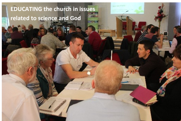
EDUCATING the church in issues related to science and God

Welcome to this edition of the newsletter in which we report on how all three aspects of the GTN strategy are progressing in a most encouraging way. We hope you will be motivated to make — or continue to make—your contribution to the whole.