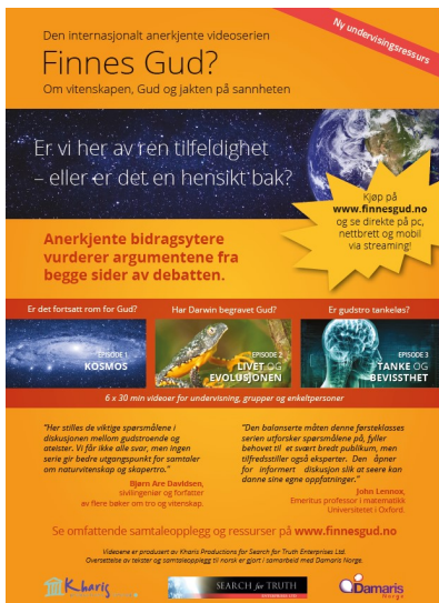
Finnes Gud? promotional flyer

Having been in operation officially for just three years, it is gratifying that GTN is drawing some international attention and being invited to contribute beyond Scottish shores.