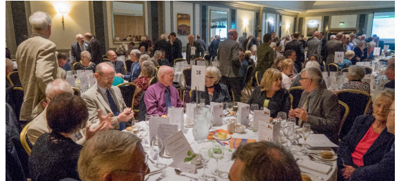
The GTN annual dinner in 2015