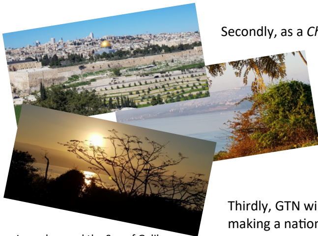
Jerusalem and the Sea of Galilee

Secondly, as a Christian organisation GTN upholds the centrality of Christ as co-architect of the creation and also as the divinely appointed means through which God has revealed himself to the world. As GTN enters the next phase, its apologetic will encompass the evidence for the creator revealed not only through the lens of science but also through the window of history in the person of Jesus of Nazareth.