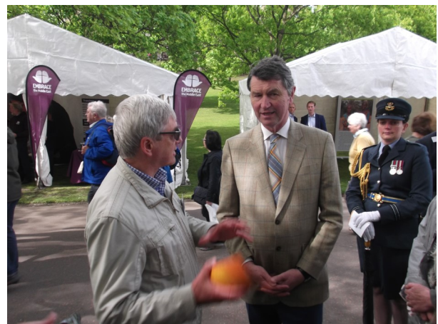
Sir Tim Laurence visits the GTN stand at Heart and Soul